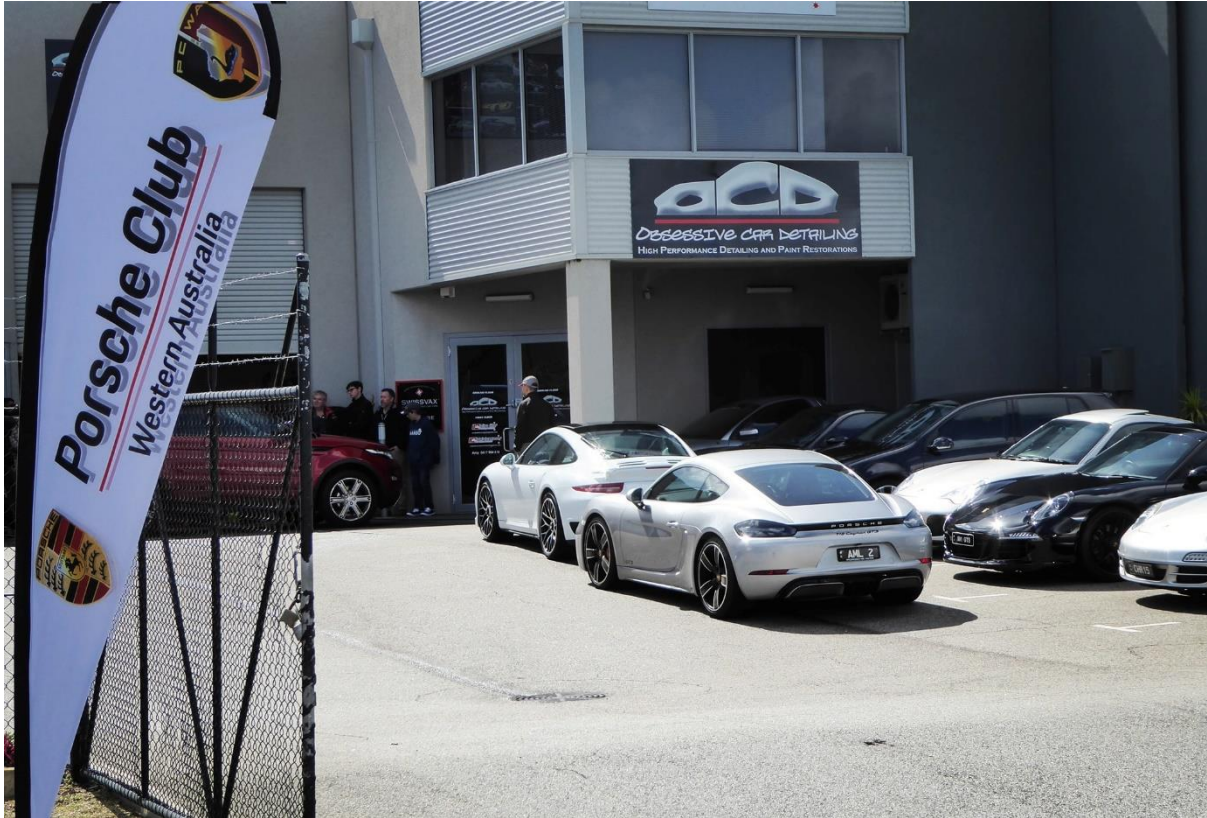
Above : Members gathering at Obsessive Car Detailing in Malaga

OCD took on a whole new meaning when Porsche Club members visited Obsessive Car Detailing for a Tech Day on how to achieve an immaculate looking Porsche.