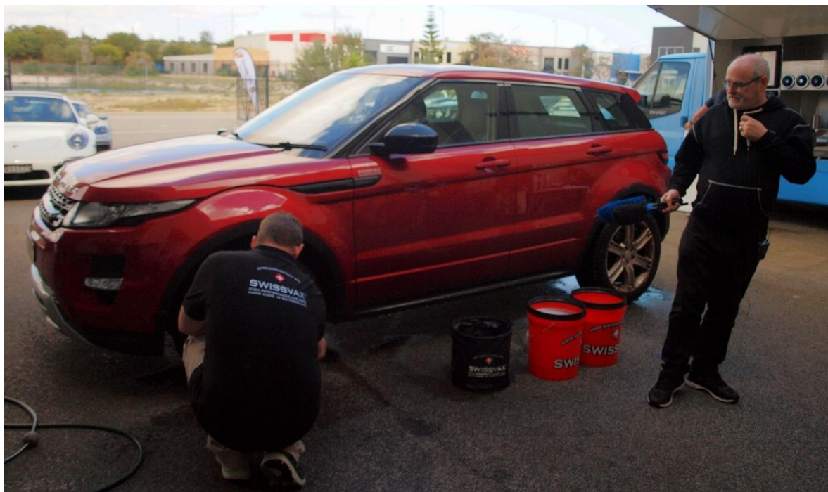
Above: Terry "on-mike" while Ric cleans rims FIRST , before the car itself

It was then onto a live demonstration of the correct way to clean your car and avoid scratches, ensuring you keep it in top condition. Our guinea pig was a Range Rover Evoque daily driver that had deliberately not been cleaned for three months.