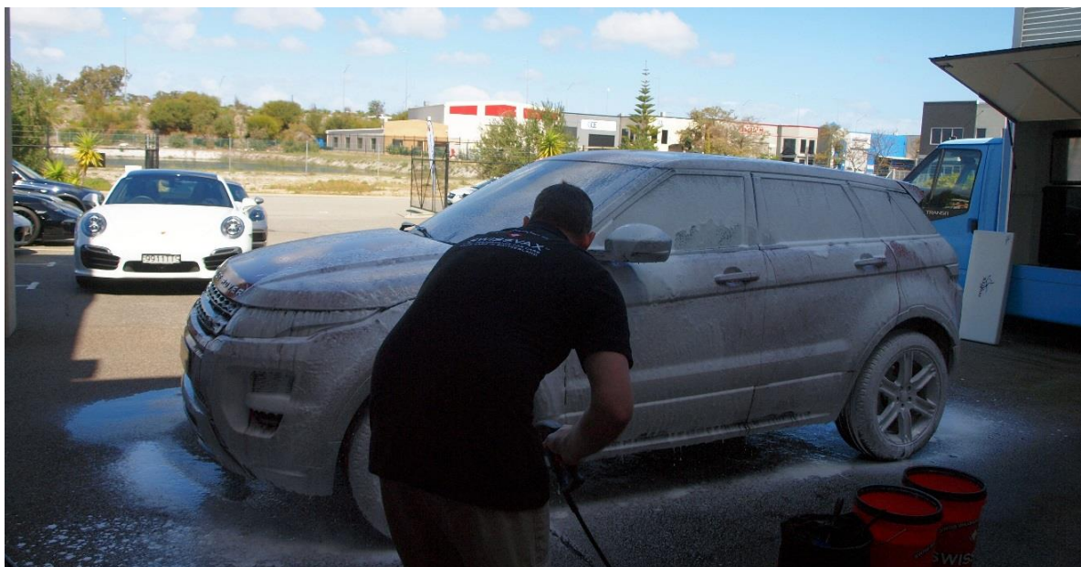
Above : Step 3 - Snowfoam power wash – only after rims cleaned and initial rinse clean of car